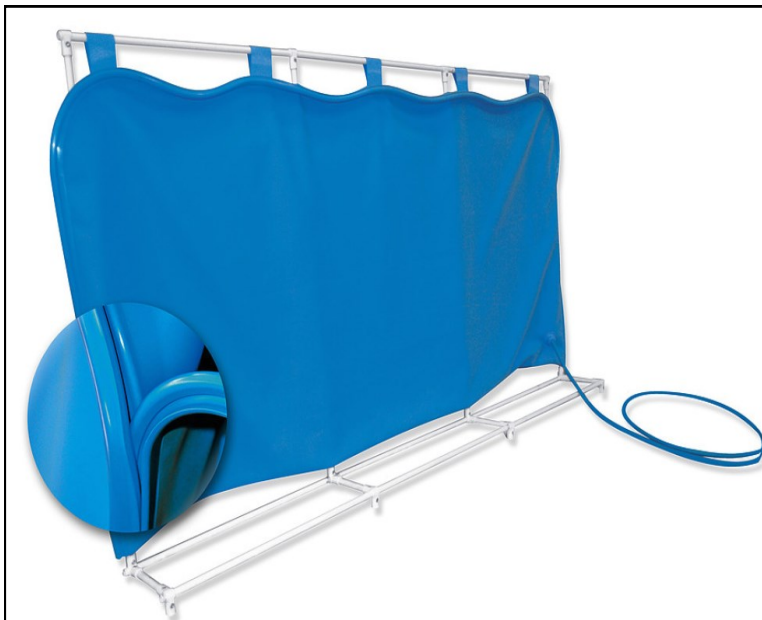
VERTICAL AUTO-CLAVE BAG

Shingle Belting's SILCO silicone vacuum bags for the lamination industry